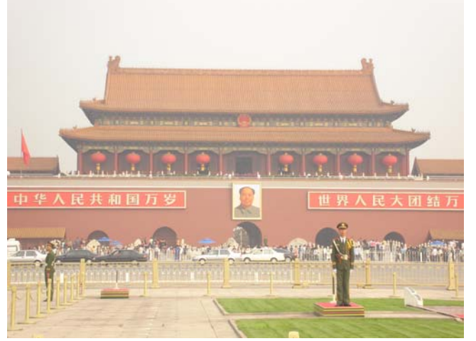
Tiananmen Gate as seen from Tiananmen Square in Beijing, 2006

Many rural believers in the registered churches live very simply and cannot afford to buy a Bible for ( themselves. These dramatic pictures show the joy radiating from Chinese believers when they receive their very own Bible! World Changer Kids is teaming up with Voice of China and Asia to provide and distribute Bibles to Chinese believers this July. Each Bible costs only five dollars. If you would like to help, please contact Voice of China and Asia (www.vocamissions.com) or World Changer Kids (www.worldchangerkids.org). Pray for Windee World and the VOCA team in China this July! Help Windee World water the "seed" she planted in China 5 years ago!